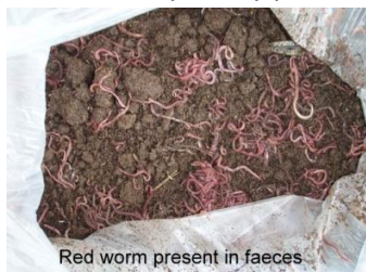
Red worm present in faeces.